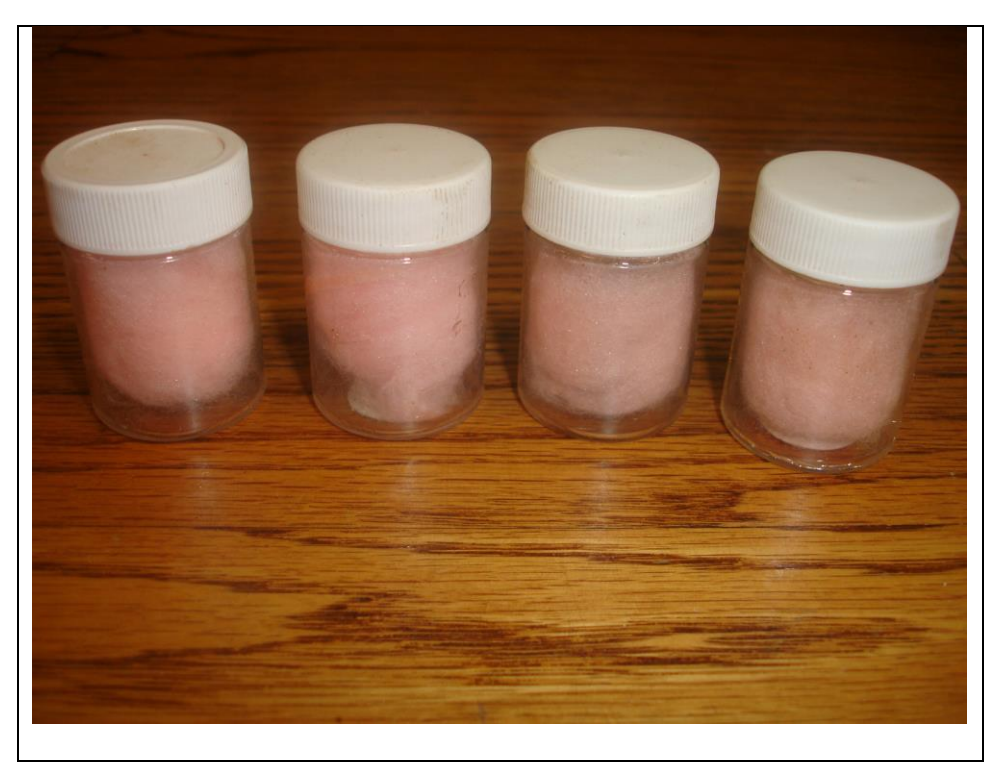
Figura 3. Ejemplos de recipientes herméticos para guardar aromas.

El uso de los sentidos para observar y comunicar las propiedades de objetos y materiales.