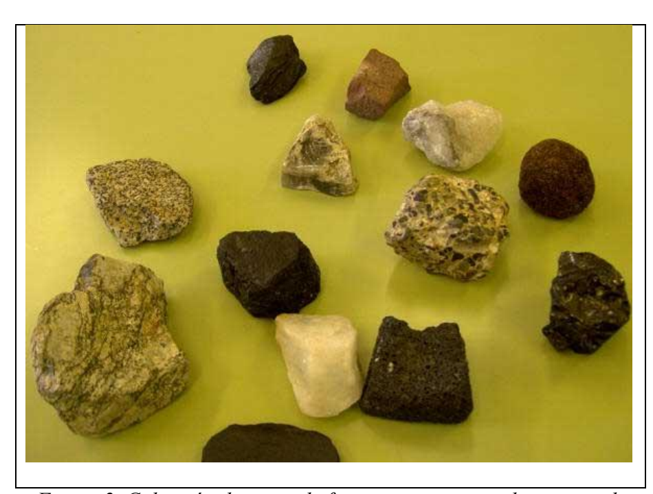
Figura 2. Colección de rocas de formas, texturas y colores variados.

Para enfatizar el uso del lenguaje académico, se recomienda que de manera gradual y una vez que han aprendido el vocabulario relacionado con el tema de las rocas (ver Figura 2), los alumnos incorporen dicho vocabulario en sus actividades orales y escritas.